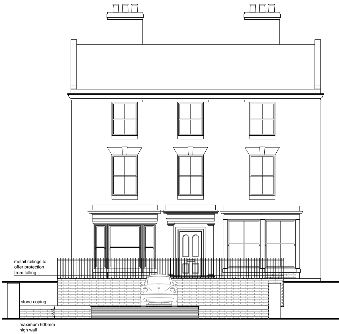
Front Elevation (including front wall)